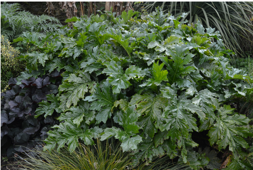
A. mollis in spring, early season growth is an advantage in mild winter climate regions.