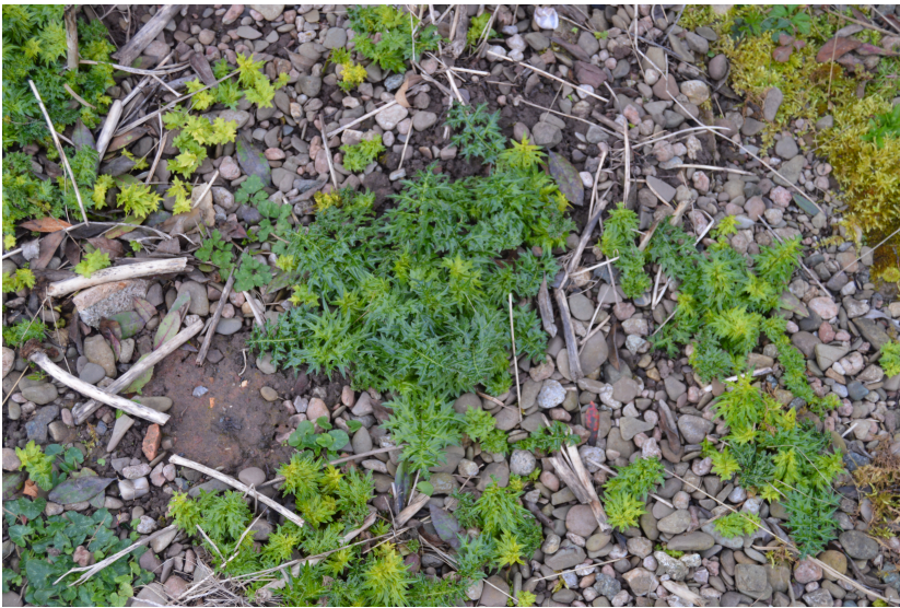
A. spinosus in early spring, showing adventitious shoots emerging from ground

( Latifolius Group ) ' Rue Ledan ' has pure white flowers on 2m stems with leaves to 1.2m!