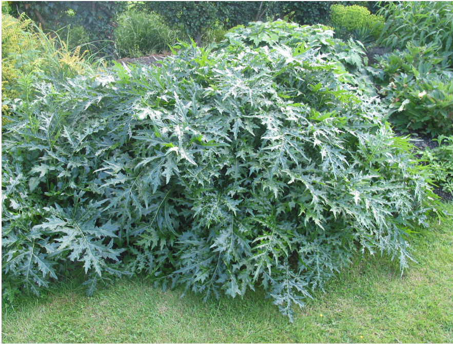
A. spinosus foliage in spring