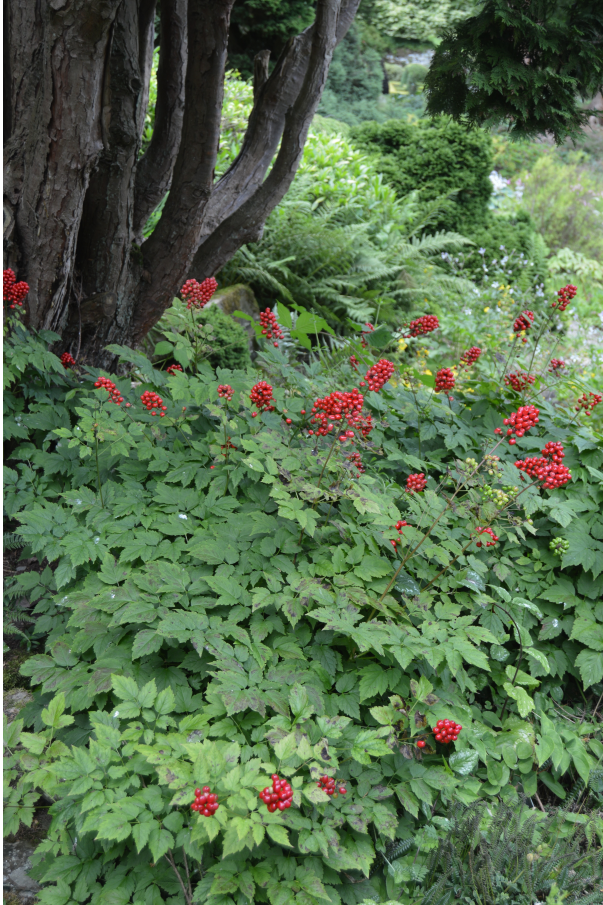
Actaea rubra , at Hergest Croft, England.