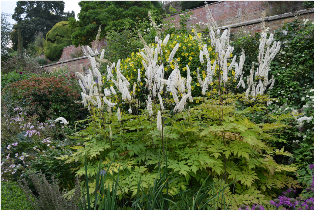
Actaea simplex 'Pritchard's Variety', Powis Castle, Wales.