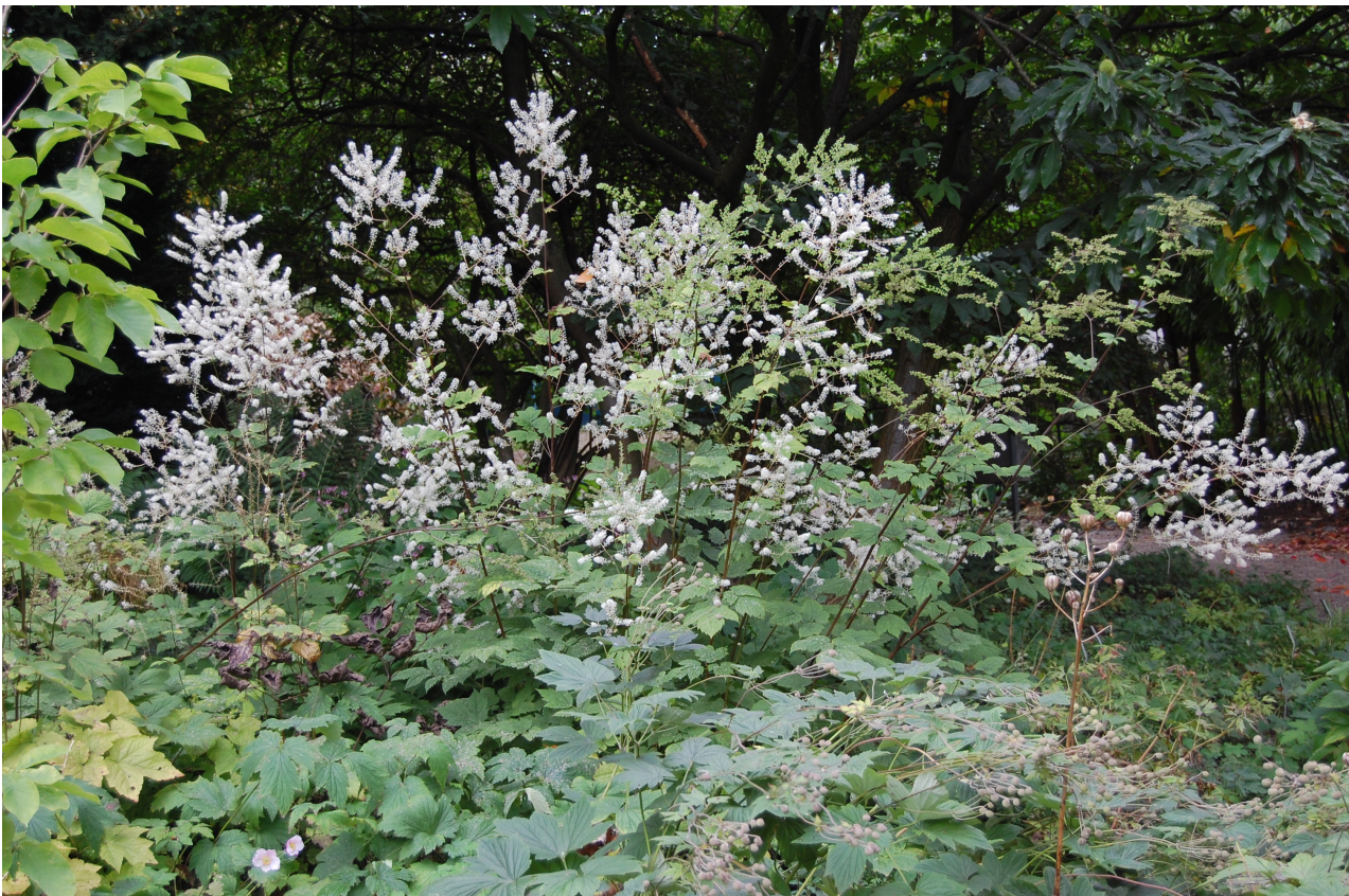
Actaea dahurica , Sichtungsgarten Hermannshof

A. 'Queen of Sheba' PBR is a hybrid of the Asian species Actaea simplex and the American Actaea racemosa from a cross made in the Netherlands by Piet Oudolf (Chicago Botanic Garden). Dark foliage and drooping flower spikes.